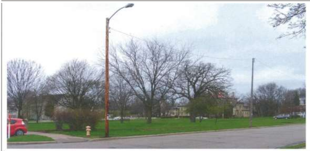
Upper Courthouse Park