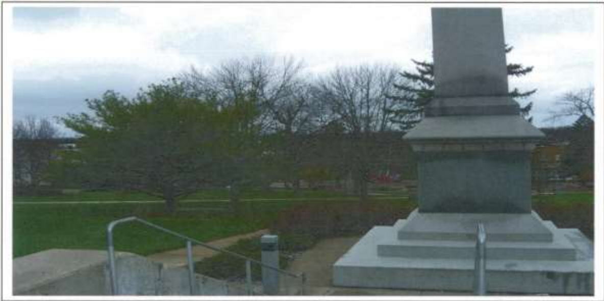
Lower Courthouse Park