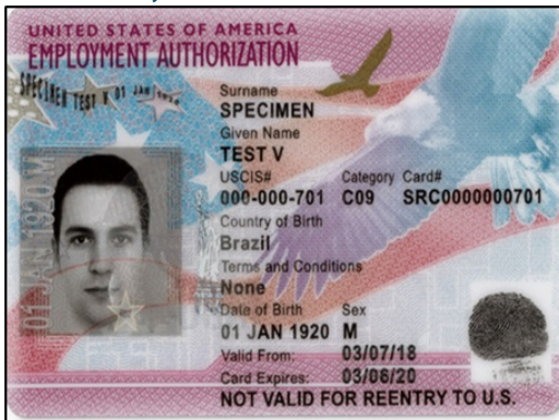
Form I-766, EAD