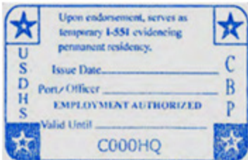
Temporary I-551 Stamp – Sample 1